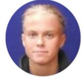
PCSO 6024 Proud

We have listened to you and the concerns you raised and will prioritise the following,