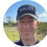
PC 1651 Stowell